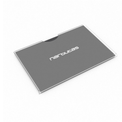
Plexiglas name card holder