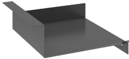
Metal shelf (right)