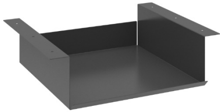
Metal shelf (central) for doors with mail slot

Customize your locker by using additional items.