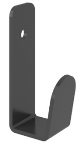
Metal hook for clothes